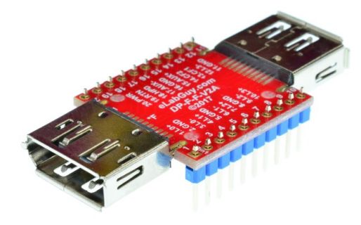
Figure 3: DP-F-F-V2A with headers