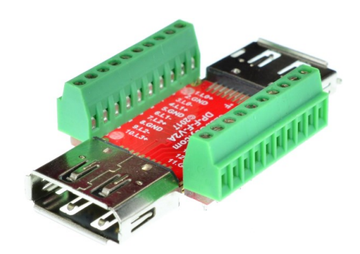
Figure 4: DP-F-F-V2A with terminal blocks